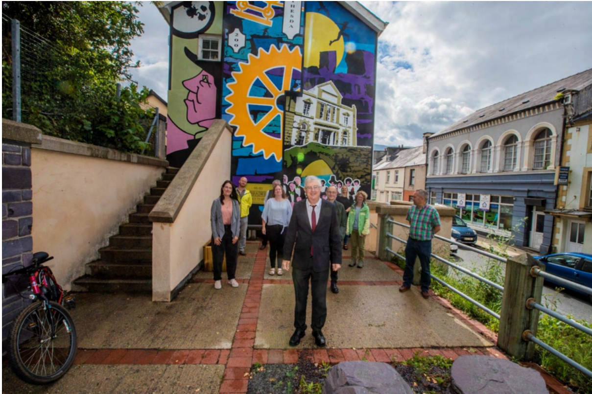
Staff and Chair of Partneriaeth Ogwen with Mark Drakeford, First Minister of Wales in July 2021.