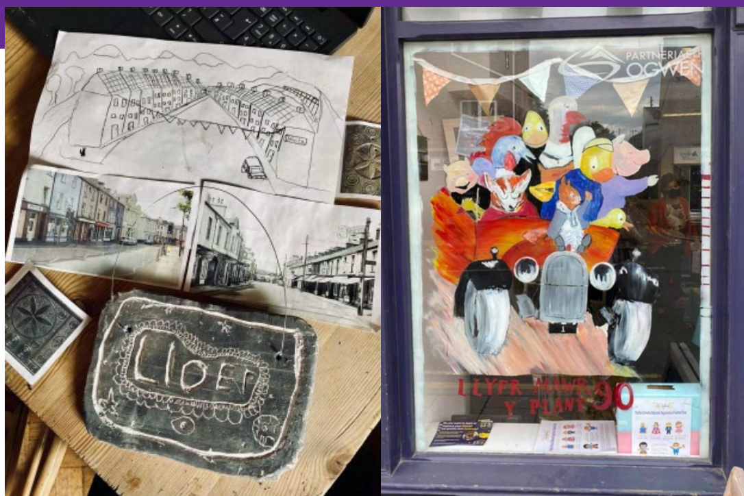
Bethesda Bicentenary art workshop for children and a shop window display to celebrate Llyfr Mawr y Plant's birthday.